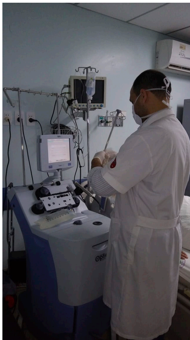
Figure 4. Apheresis machine used for collecting stem cells for autologous and allogeneic SCTs from peripheral blood.