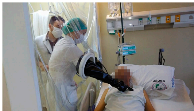
Figure 3. HEPA-filtered room with positive pressure where patient is examined through a plastic separator.